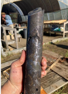
Drill hole WPC21-09. Base metal mineralization visible

2022 Objective: Expansion of Waterpump Creek deposit with >4,000 m drilling of high-grade sulfide CRD mineralization and exploration along the Lash Hurrah trend